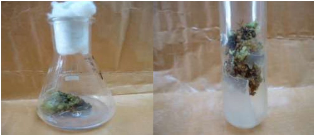
Figure 2. Callus induction on 1 mg/l BAP + 0.50 mg/l NAA in C. reticulata

When explants were inoculated on MS medium supplemented with BAP in combination NAA. The callus formed on the basal part of the explants containing the meristematic tissue. The callus was soft in texture and friable in structure. The callus did not form on medium lacking growth regulators. The callus formation was greatest on the medium containing BAP 1.00 mg/l plus NAA 0.50 mg/l. The addition of BAP or NAA alone did not produce callus. The high conc. of BAP with NAA also inhibited the callus formation. The sub cultured callus grew satisfactorily on revised MS medium supplemented With BAP+NAA same concentrations (Table 2). Proliferated callus was structurally indistinguishable from the initially induced from the shoot tip explants.