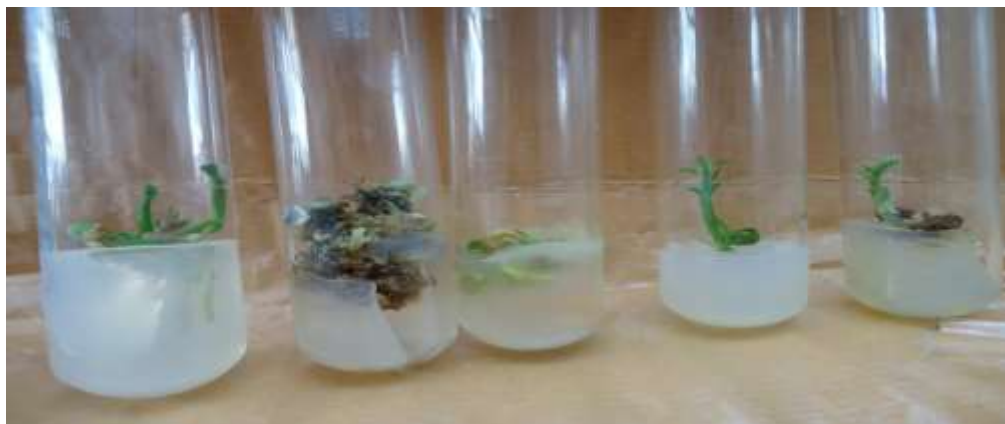
Figure 3. Various stages of C. reticulata from multiple to rooting.